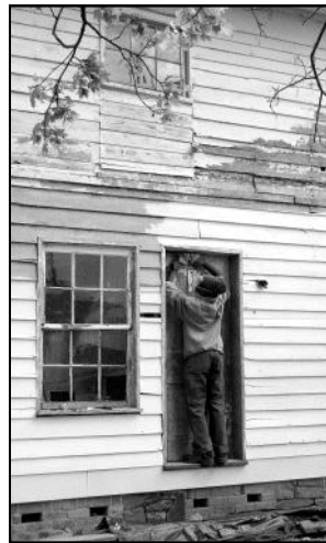
200 years of old paint: The Collett House